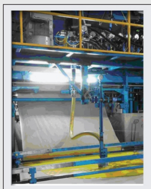
LIQUID LAY DOWN

Electrical system 415V AC 50 Hz, 3 Phase - Special voltage and frequency can be provided against order.