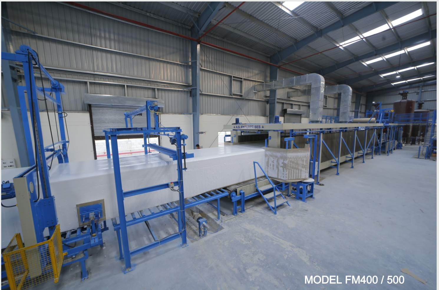
MODEL FM400 / 500

INDIA'S LARGEST MANUFACTURERS OF PU FOAM PROCESSING AND CUTTING MACHINES